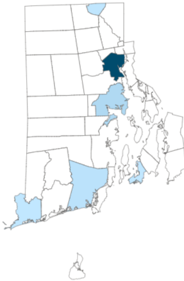
Nonprofit Hospital Assistance by Municipality

Auxiliary Information: The map below shows the distribution of grant payments.