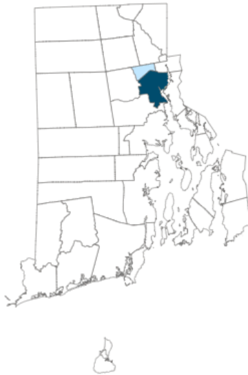
For-Profit Hospital Assistance by Municipality

Auxiliary Information: The map below shows the distribution of grant payments.